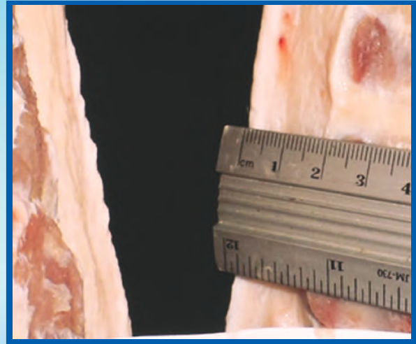
(SOMA-MEAT) Backfat thickness: 2.0cm